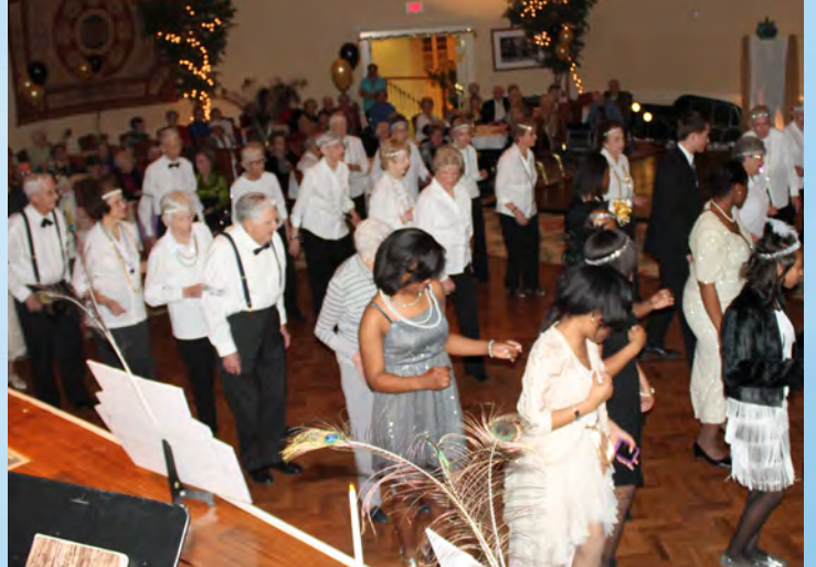
The dance floor was the place to be at The Golden Gatsby Gala