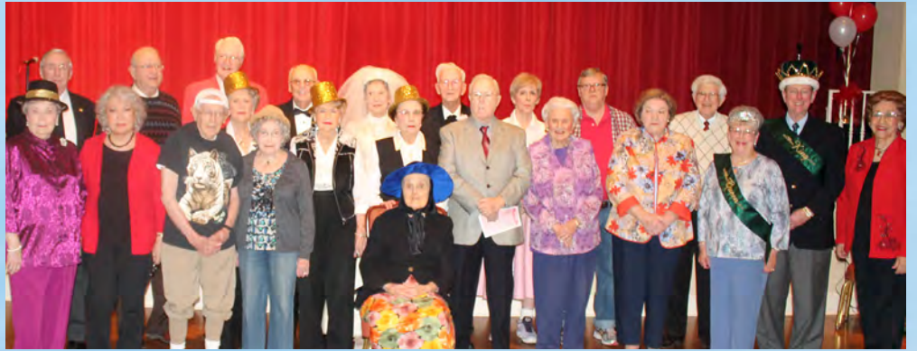
The Ham-ateur Club presented "Lifetime of Love" for their early spring performance, which featured skits, songs, poems, readings and more! If you are interested in joining in the fun, they will be meeting Wednesday, April 8th at 1:00pm in the Chapel to start planning their annual Ham-ateur Night with the Stars!