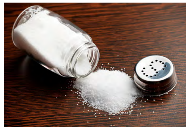
Puzzle Solutions - page 21